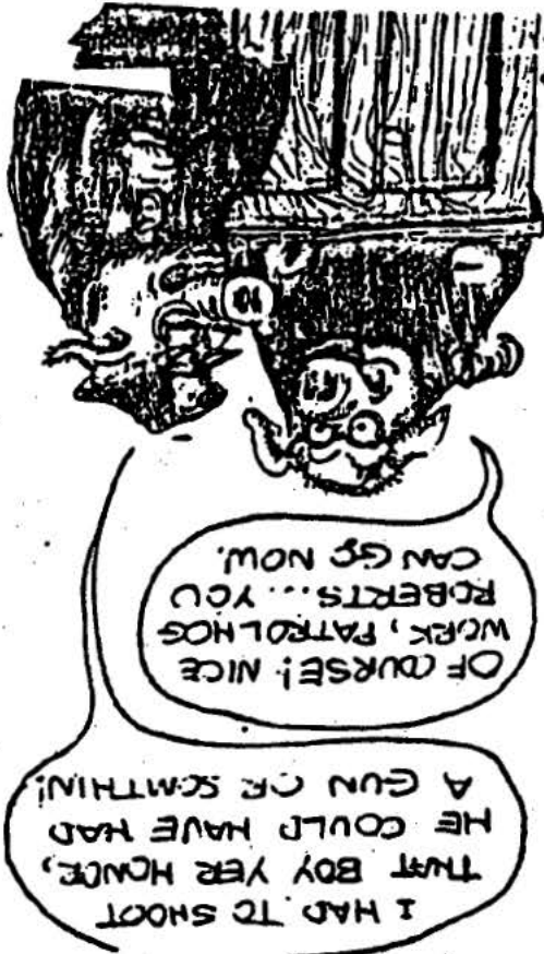
A Typical Underground Paper Cartoon!